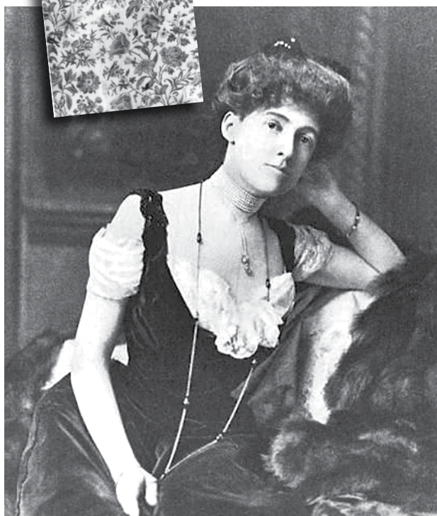
Photo of Edith Wharton

This event, presented by the Upper Hudson Library system, is part of The Big Read , an initiative of the National Endowment for the Arts in partnership with the Institute of Museum and Library Services and Arts Midwest.